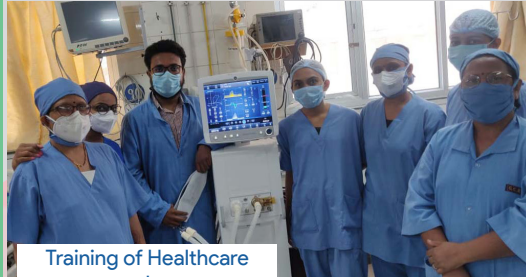
Training of Healthcare workers