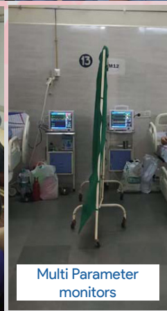
Multi Parameter monitors